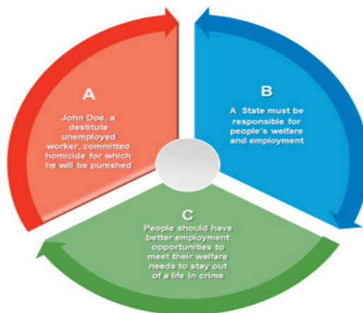
Figure 1. Socratic logic as a transformative process.

Based on the above explanations, Figure 2 shows how a Socratic inquiry works in discussing and concluding a criminal case in five steps 12 .